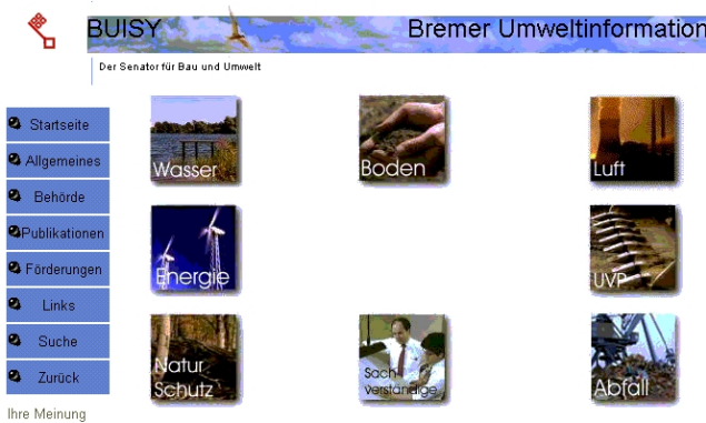
Abbildung 1: The main areas of the BUISY system

the publication of approved information on the internet.